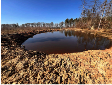
Domaine d' Haugimont